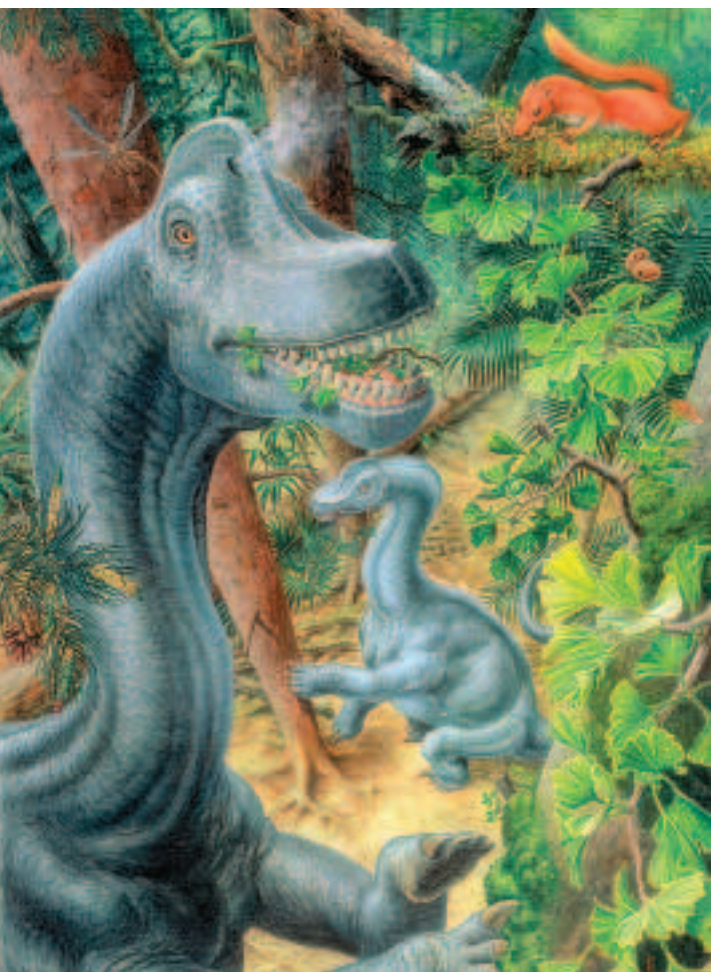
Brachiosaurus. English School, (20th century). Oil on canvas. Natural History Museum, London, UK.

Literary Element Foreshadowing Which of Eckels's earlier questions foreshadows his action here?