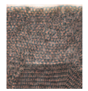
Visual Vocabulary Mail is a flexible body armor made of small, overlapping or interlinked metal plates or rings.

terrible warrior. Each thigh was a ton of meat, ivory, and steel mesh. And from the great breathing cage of the upper body those two delicate arms dangled out front, arms with hands which might pick up and examine men like toys, while the snake neck coiled. And