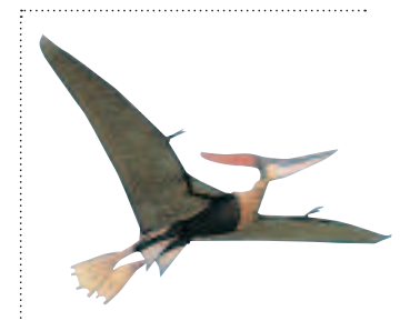
Visual Vocabulary Pterodactyls (ter 'ə dak 'tilz) are extinct flying reptiles with wingspans of up to forty feet.

broad and the jungle was the entire world forever and forever. Sounds like music and sounds like flying tents filled the sky, and those were pterodactyls soaring with cavernous gray wings, gigantic bats of delirium and night fever.